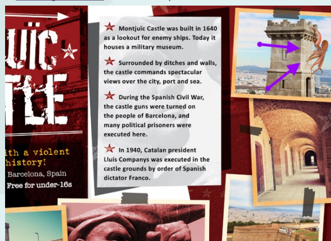
See, Try and Do' screen example